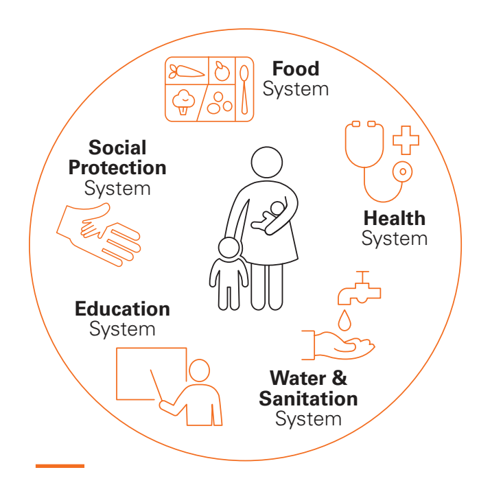
Improving maternal and child nutrition requires a systems approach

UNICEF works with water and sanitation systems to protect, promote and support diets, services and practices that prevent child malnutrition in all its forms. We prioritize five areas of engagement, advocacy and support: (1) free, safe and palatable drinking water for healthy diets; (2) safe sanitation services and practices for good nutrition; (3) safe hygiene practices for good nutrition; (4) capacity of the water and sanitation workforce for nutrition; and (5) synergistic community-based programmes for nutrition, water and sanitation.